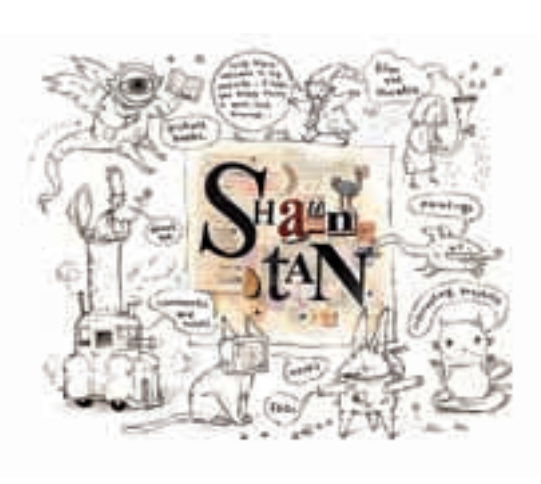
Shaun Tan's website at http://www.shauntan.net.

To acquire the full scheme of work for Longing and Belonging keep your eyes open in 2008 for Patrice Baldwin's next book (being published by Sage publications).